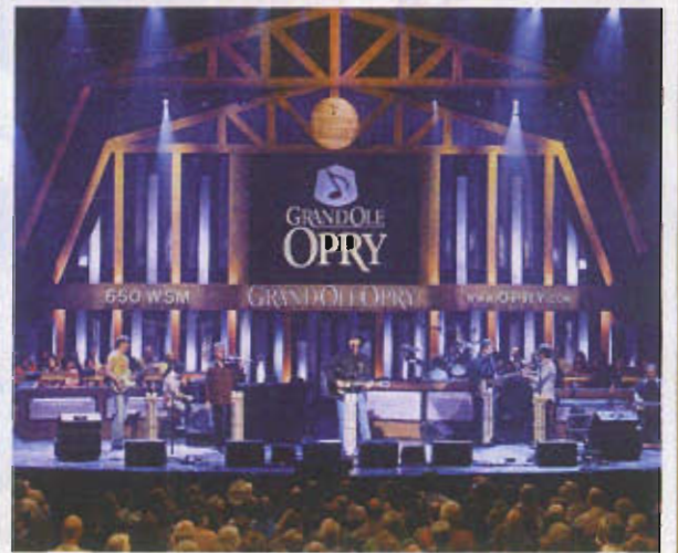
Clockwise: Jack's Bar-B-Que pours out a steady stream of hickory-flavored smoke, drawing people from all over the world on their visit to Nashville; Gaylord Opryland Hotel Grand Ole Opry's stage; Carl Perkins' Blue Suede Shoes at the Country Music Hall of Fame.

soothing facial and body pampering treatments at the Poseidon Spa for a truly relaxing experience!