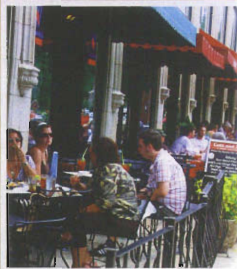
Clockwise: Guest room at the Grand Bohemian Hotel in Asheville; The Biltmore Estate; Scattered among the shops are numerous "Mom and Pop" restaurants that offer everything from the classic breakfast to European and Asian delights.

As fall approaches, Atlantans get that familiar "tug" to drive northward and take in the orange and yellow hues of the changing season. The Smoky Mountains offer many stunning vistas, but where do you go for an easy getaway from Atlanta that offers both an awe-inspiring journey and a great destination? Here are two cities that will take you there, with two very different experiences.